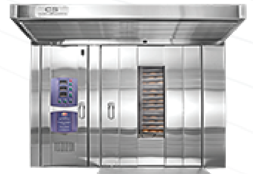
Rotary Rack Oven