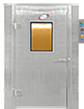
2 Trolley Proofer