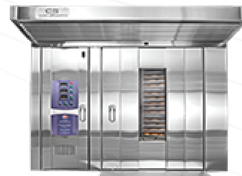
Rotary Rack Oven B - 1100