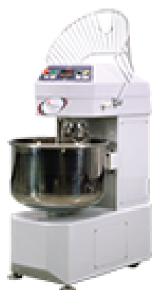
Spiral Mixer CSM- 75